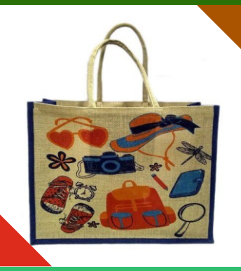
Printed Natural Jute Bag