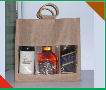
3 Bottle Carry Bag