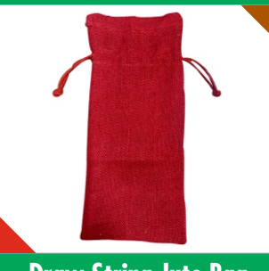
Draw String Jute Bag