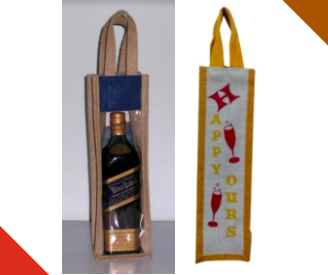
Bottle Carry Bags